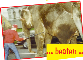
... beaten ...